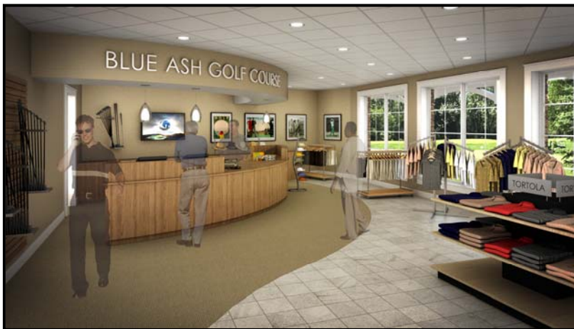
Pro Shop pictured to the left.

Above is the lower level floor plan . This level of the facility is primarily geared towards the golf operations and includes an expanded customer service desk area, pro shop, & Sandtrap Sandwich shop (see more visuals below). It is accessible from the north/rear elevation of the building. Dining style is casual/informal on this level, and also includes a point-of-sale purchase of food items for golfers from the course. Storage for 75 carts is provided in the western portion of the building.