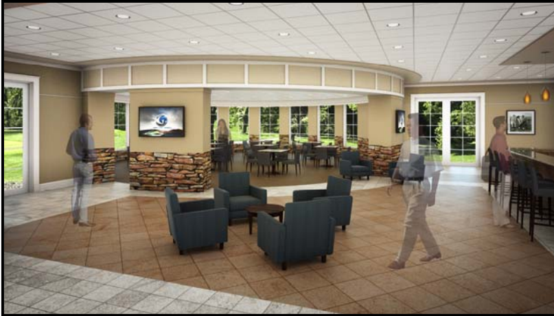
Sandtrap Sandwich Shop pictured to the left.