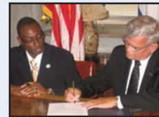
Pictured L to R are Cincinnati Mayor Mark Mallory & Blue Ash Mayor Jack Buckman signing documents for Blue Ash's purchase of the 130 acres of future park property.

happening there soon since the City of Cincinnati will have to relocate and reconfigure the Blue Ash Airport facilities on the remaining 100 acres of the property before Blue Ash can begin any park development. In the meantime, conceptual planning for the park will continue, and Blue Ash will also continue work with Cincinnati towards the goal of relocating their airport facilities on those 100 acres -- essentially to the south and east of the existing runway, towards Carver Road. Cincinnati has three years, plus two one-year optional extensions to relocate and reconfigure the airport facilities.