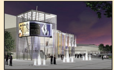
Architect's rendering of a future PACC, just one concept being considered for the future 130-acre park.