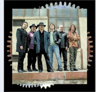
Charlie Daniels (pictured upper right) and 38 Special (pictured lower right) are among the national entertainers set for this year's July 4 event at the Sports Center. Did you know that in recent past July 4 events, an estimated 75,000 people have been on the grounds of the Sports Center, and that an estimated additional 30,000 watched the fireworks from peripheral locations?