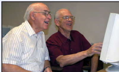
The Sycamore Senior Center offers many classes & activities for area senior citizens. Pictured above are two gentlemen participating in a computer class.

The SYCAMORE SENIOR CENTER offers an abundance of activities for senior members as well as nonmembers. Something new planned in 2008 is Monte Carlo Night set for Wednesday, June 18th, from 6PM - 10PM. Drinks, hors d'oeuvres, casino games, and much more fun is planned. Call the Center at 984-1234 with questions about Monte Carlo Night, or to find out more about the hundreds of activities available to you -- including many day trips, classes, and celebrations planned each month at the Blue Ash based Sycamore Senior Center. Call the Center ... you'll be so glad you did!