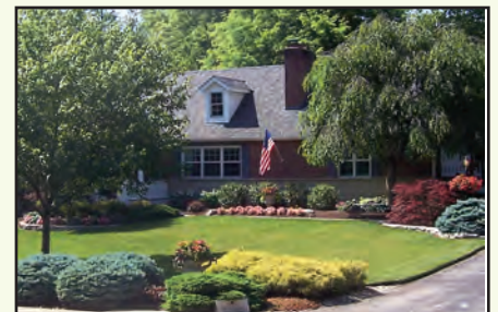
This Blue Ash home on Zig Zag Road has won multiple Beautification awards in recent years.