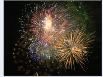
Don't miss the Tri-State's & Rozzi's largest July 4th fireworks display in Blue Ash at the Sports Center.

Suites; Enquirer Media; Gutter Shutter Company; LSI Industries; MillerCoors; Nina Paul Jewelry; Rozzi's Famous Fireworks; and SmarTravel. For more info, including event rules, call the hotline at 745-6259, or click on the "concerts & special events" calendar on the BlueAsh.com website.