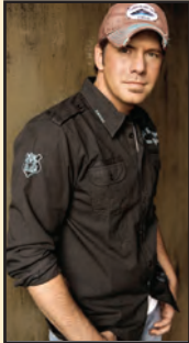
Rodney Atkins takes the SummerBratation stage Saturday

This fun family event, made possible by title sponsors B105.1 and 94.9 The Wolf and presenting sponsor The Kroger Co., features bar-becue cooking, free national-level entertainment, a family fun area with festival rides and games and other entertainment. This year's national country music