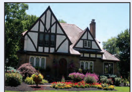
Pictured is the Committee's Choice Beautification Week Selection @ 10116 Kenwood Road