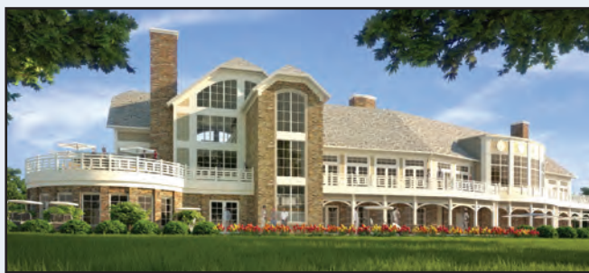
Pictured above are two architect's renderings of the front (top graphic) & rear (bottom graphic) of a proposed new clubhouse/banquet facility. Renderings by Steed Hammond Paul. (Click on BlueAsh.com for many more renderings showing inside portions of the facility.)